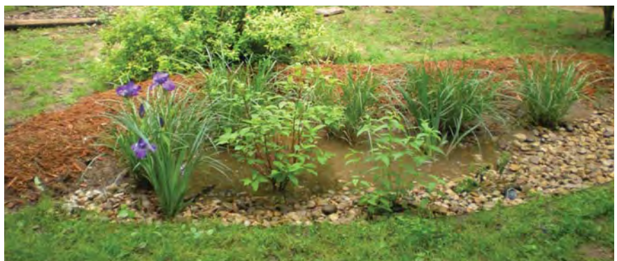
Figure 1. Examples of rain gardens.